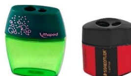
2 hole sharpener