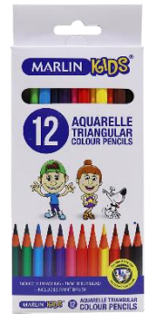
Aquarelle TRIANGULAR colour pencils